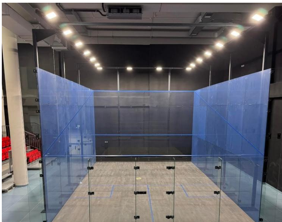
Show Court at brand-new National Squash Centre

Venue: Brand-new state-of-the-art National Squash Centre in Malta Host venue of the European Team Championships & Youth Commonwealth Games 6 brand-new courts including one all glass show court (with seating for 350)